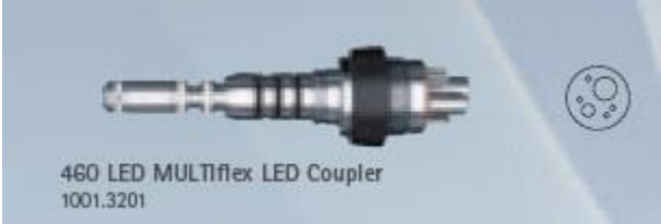
HIGH SPEED COUPLER