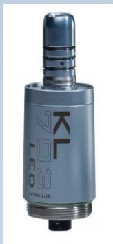
INTRA LUX KL703LED

Note: All the attachments shown above can be used with air or electric motors with E-Style connection.