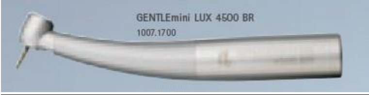
HIGH SPEED HANDPIECE