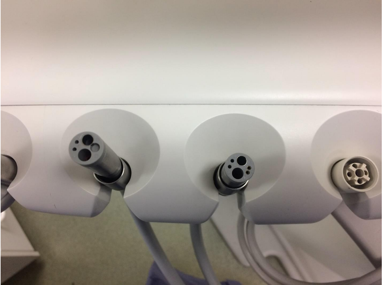
The newer chairs (21)